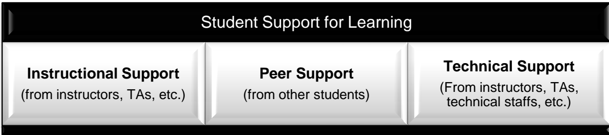
Figure 1. A framework of student support for learning